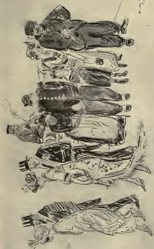
BESIDE THE LUMINOUS DOORWAY HUDDLED A LITTLE GROUP OF ONLOOKERS.